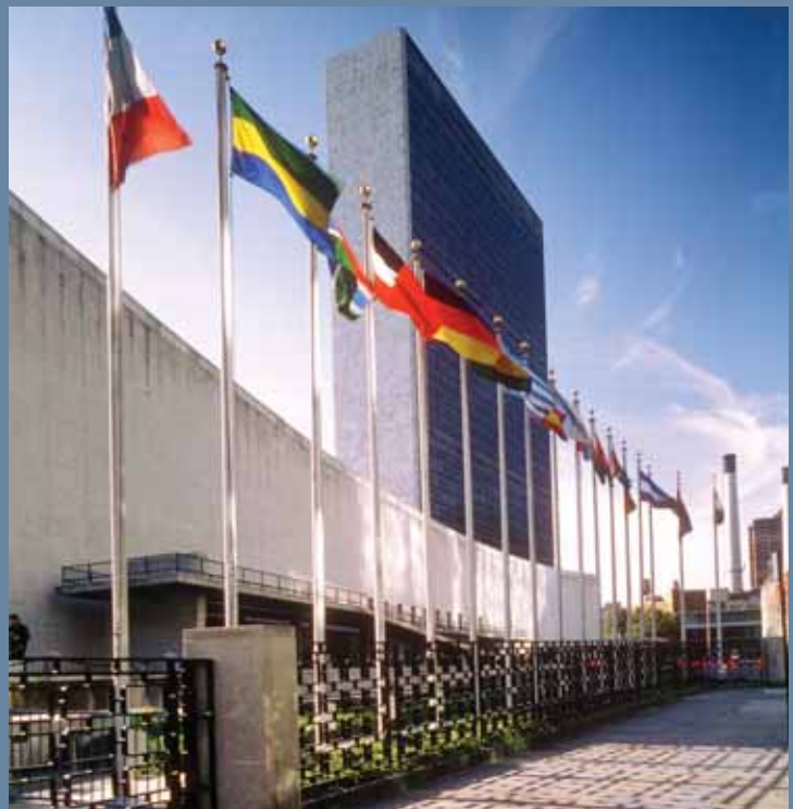
IFIP will hold a session at the United Nations as part of its conference

The event will discuss lessons learned and provide recommendations on improving the effectiveness of donor portfolio. We will then visit the UN Headquarters for a special IFIP session during the Permanent Forum for Indigenous Issues, where this year nearly 1,500 Indigenous leaders and representatives will meet. For more info and registration form, email ifip@internationalfund.org