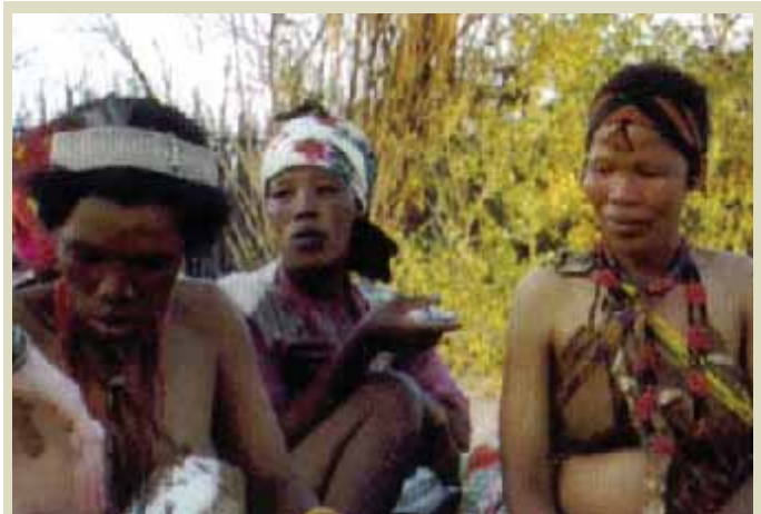
The San women gather to share Indigenous knowledge.

2 Bringing Indigenous Voices to the World Water Forum