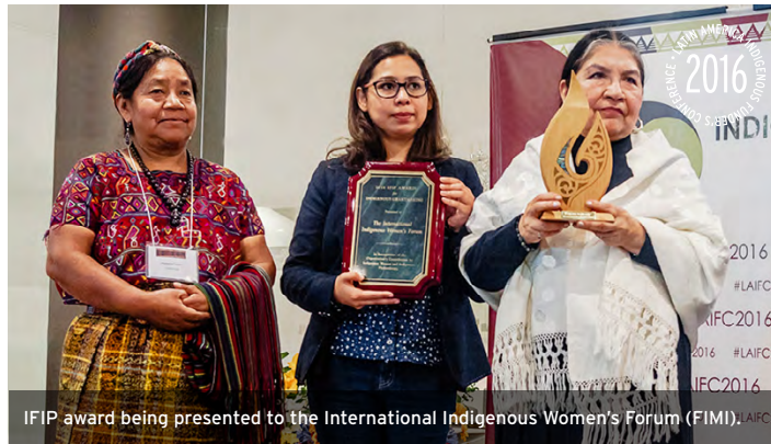
IFIP award being presented to the International Indigenous Women's Forum (FIMI)

Suggestions included: Train Indigenous women on such issues as land rights and business strategy; support women's research in their communities; provide materials in their languages, and promote solidarity among Indigenous women at all levels, from the grassroots to international.