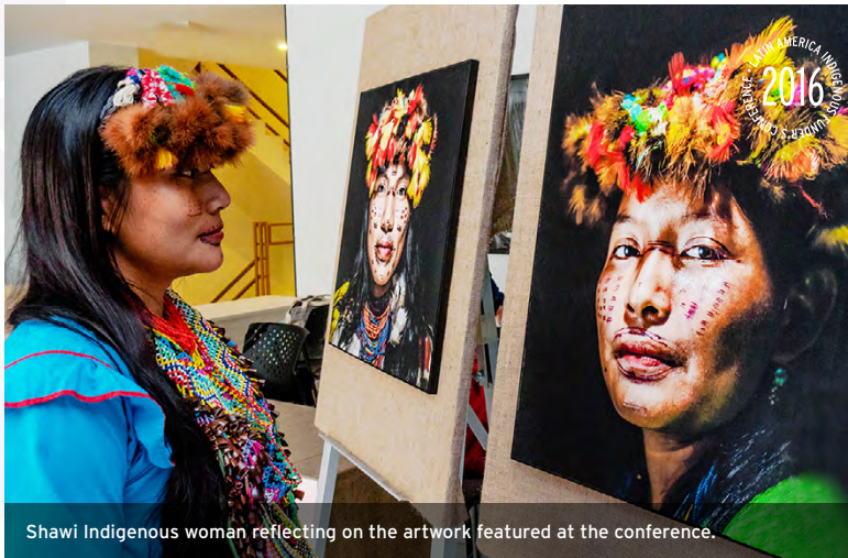
Shawi Indigenous woman reflecting on the artwork featured at the conference.

Each day participants (a group consisting of donors, Indigenous leaders, and environmentalists) learned about the decades-long struggles of these communities to protect their land from such invasions as illegal loggers and palm oil industries. In each community, the group was warmly welcomed by Shipibo families with traditional songs.